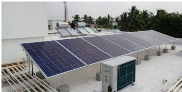
Figure 22.1 Solar Panel

Arrangement of many solar cells side by side connected to each other is called solar panel. The capacity to provide electric current is much increased in the solar panel. But the process of manufacture is very expensive.