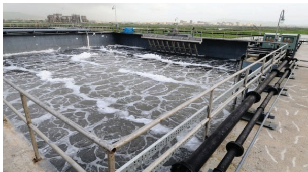
Figure 22.4 A view of sewage treatment plant