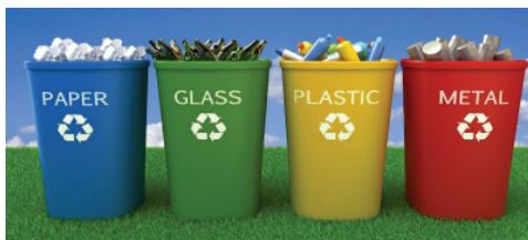
Figure 22.7 Collection of various types of solid wastes in separate bins