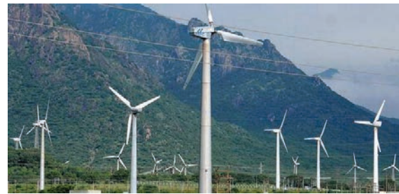
Figure 22.2 Windmill

Windmill is a machine that converts the energy of wind into rotational energy by broad blade attached to the rotating axis. When the blowing air strikes the blades of the windmill, it exerts force and causes the blades to rotate. The rotational movement of the blades operate the generator and the electricity is produced. The energy output from each windmill is coupled together to get electricity on a commercial scale.