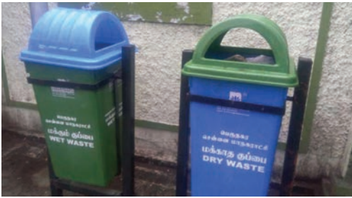
Figure 22.6 Collection of degradable and non-degradable solid wastes